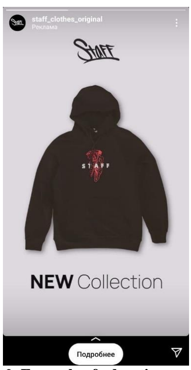
Fig. 2. Example of advertisement on Instagram in «Stories»

Bloggers can act as opinion leaders for their subscribers, adjust their perceptions and impose them the products and services of brands that they may not even need. Many people become so addicted to social networks and video hostings that they spend almost all their free time on them every day. Such people constantly monitor the Instagram pages or watch videos on YouTube from favourite bloggers [5].